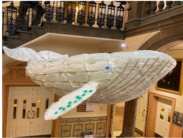
Festival for the Future

During July, each of the borough's four museums – Grosvenor Museum, Stretton Watermill, Lion Salt Works Museum and Weaver Hall Museum - will host a touring 'eco' exhibition designed by West Cheshire Museums. Featuring historic items from its collection, the exhibition will tell a compelling eco story, showing how people in the past led very sustainable lives. Virtual reality technology will show what the future might look like if humanity continues its disposable 'one-use' lifestyle.