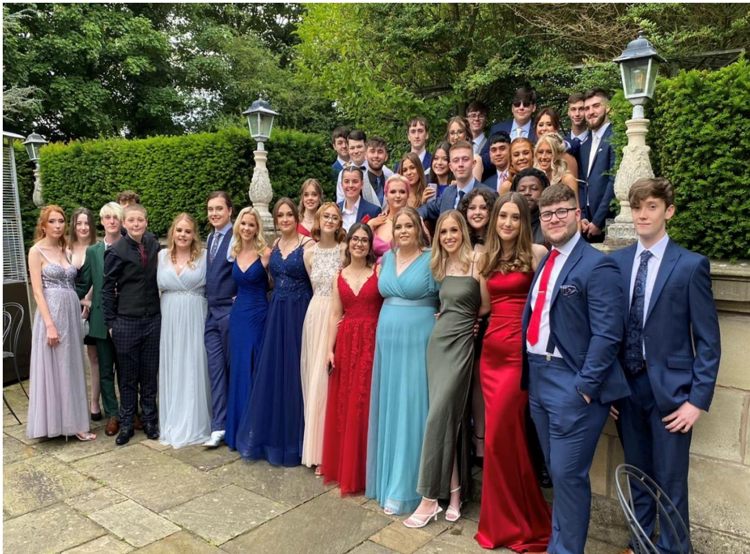
Year 13 at their Prom at Brook Meadow, Willaston

I wanted to say a big thank you to all the staff who attended the Year 13 prom last night. A great time was had by all. As the students had not been able to have their Year 11 prom due to COVID restrictions they all came dressed in their Year 11 prom outfits and they looked amazing. The DJ at the venue commented how lovely and polite our students were and how they were a credit to us. He said they had been amazing all night. Thanks again and enjoy the 4 day break.