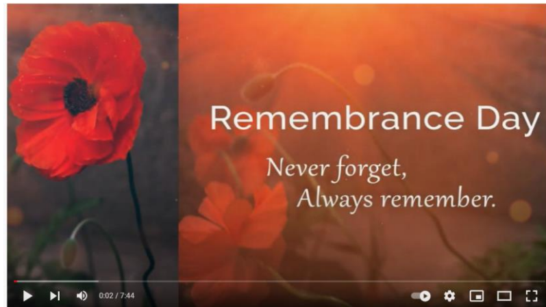
2021 Remembrance Day Video Service - EPCHS